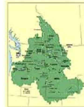
Map of Columbia River Basin

In EPA's 2006-2011 Strategic Plan, the Columbia River Basin was elevated to one of our Nation's Great Water Bodies, joining the Chesapeake Bay, Great Lakes, Gulf of Mexico, South Florida Ecosystem, Long Island Sound and Puget Sound. The Columbia River Basin joins the six other Great Water Bodies in Goal 4: Healthy Communities and Ecosystems , focused on protecting, sustaining and restoring the health of critical natural habitats and ecosystems. This plan is the Agency's road map for future work efforts and provides a mechanism to measure progress in protecting human health and the natural environment.