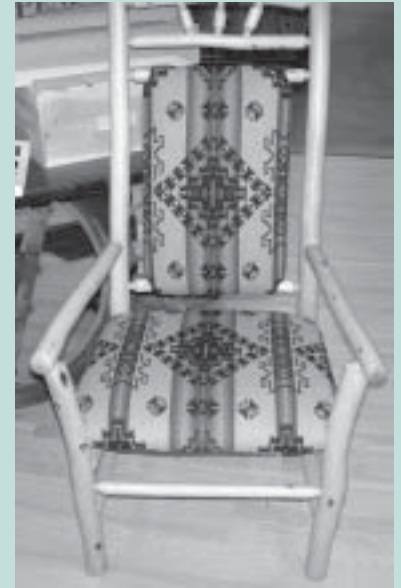
Example of Native American furniture. Photo taken at the Confederated Tribes of the Umatilla Indian Reservation.