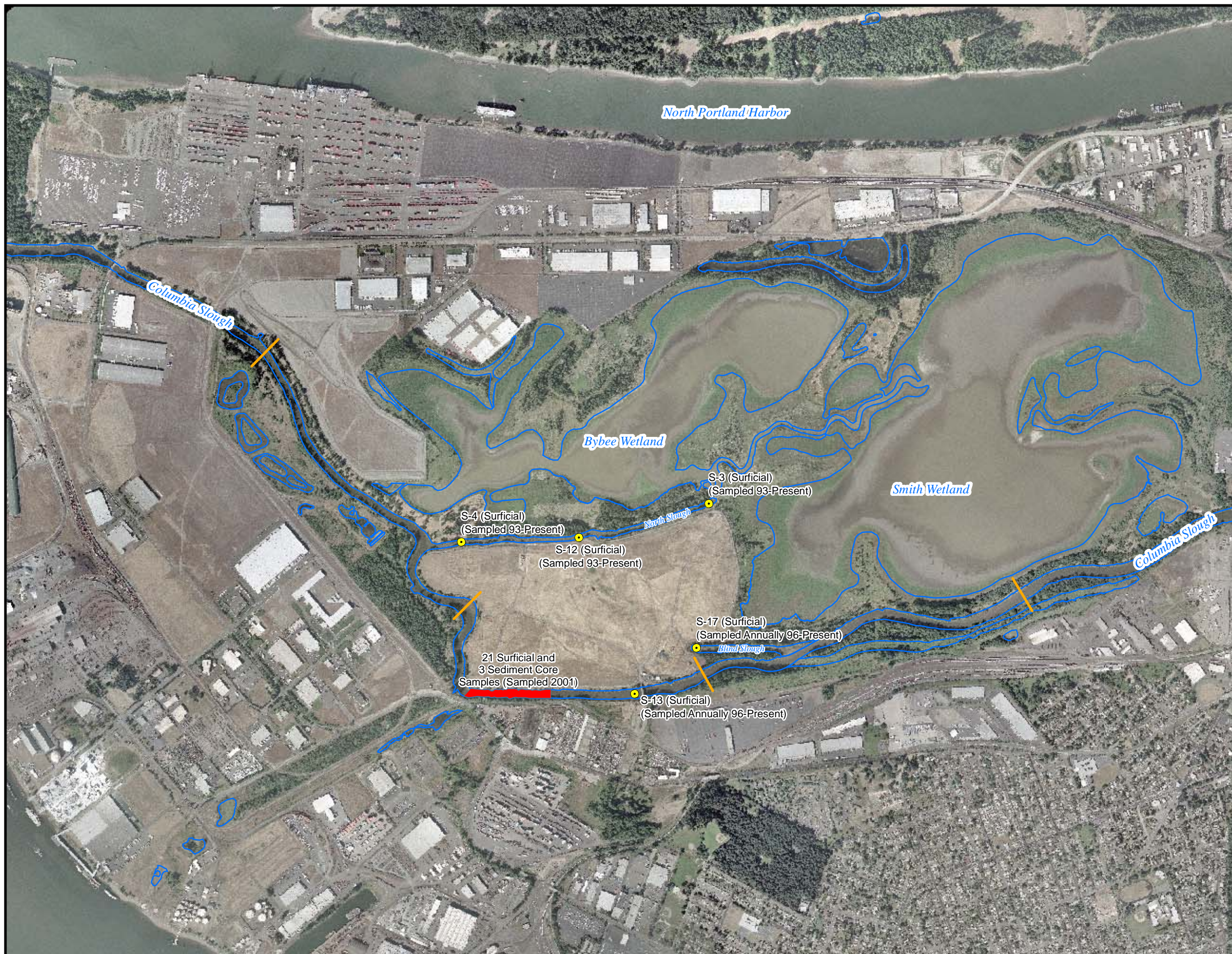
Figure 1 Location of Historic Sediment Samples (Post-2000 Data)