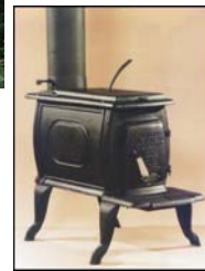
EPA Exempt Stove